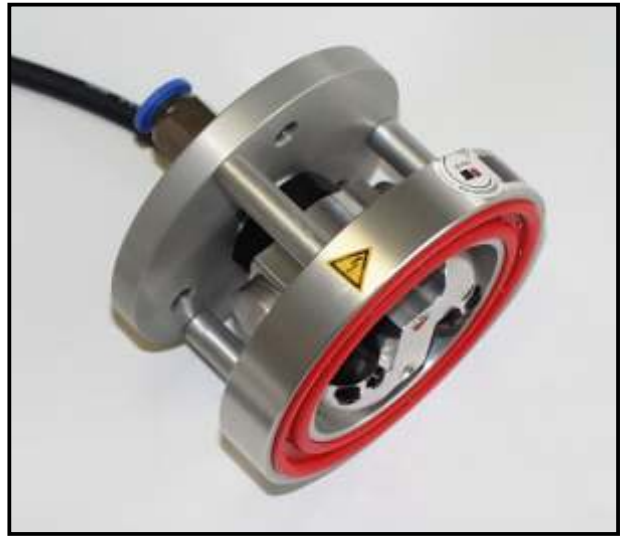
Circle Cleaner O1

The unit is supplied complete and ready to use. A compressed air connection is provided. The integrated ring electrode must be connected to a compatible HAUG high-voltage power pack. Three threaded mounting bores allow the unit to be mounted flexibly.